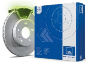
Continental_PP_ATE New Original_Verpackung

Continental is significantly expanding its portfolio for engine management and fuel supply – by around 700 part numbers by 2025.