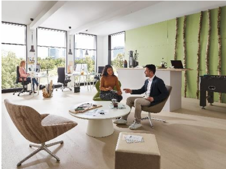
Continental_pp_laif VyP Nappa_1.jpg

laif VyP Nappa is ideal for seating that is used for extended periods, like in this office.